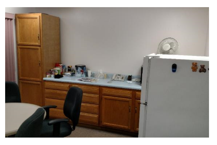
Proposed City Manager Office – Sink and cabinets to be relocated. Soffit to be removed. Walls repaired as needed.