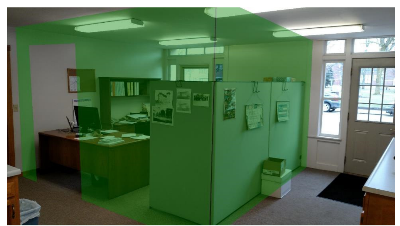
Proposed Finance Director Office – Note overhead light fixtures to be relocated into the new corridor.